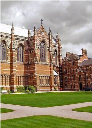
Keble Chapel across the Liddon Quadrangle